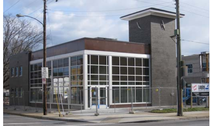
New Langley Federal Credit Union branch at 7420 Granby St.