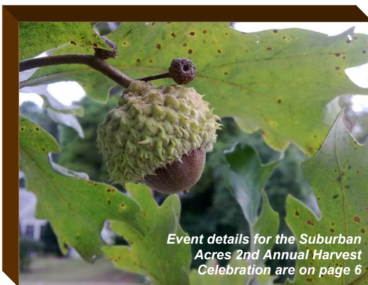
Event details for the Suburban Acres 2nd Annual Harvest Celebration are on page 6

I have one very specific memory from my childhood of sitting at the dinner table waiting for my father to come home from work. Looking at the sliding doors in our dining room, it was pitch black outside and I could see only my reflection in the glass. It couldn't have been late into the 5:00 hour as I sat...waiting and feeling a bit sorry for my dad who left that morning before light and would be returning after dark.